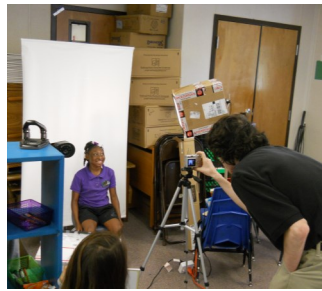
Yearbook student uses homemade lightbox to light profile pictures.

What does a photographer need anyway? A backdrop? As you can see in